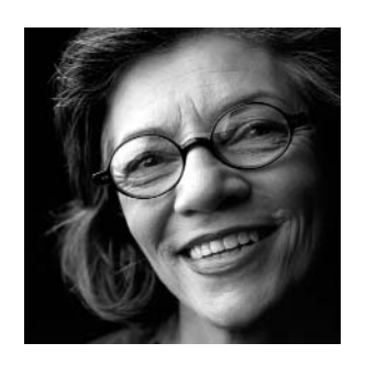
"I used this Guide when I needed to know who paid first for my health care."

This Guide explains how Medicare works with other kinds of insurance or coverage and who should pay your bills first. Some people with Medicare have other insurance or coverage that must pay before Medicare pays its share of your bill. You may have more than one type of insurance or coverage that will pay before Medicare. Tell your doctor, hospital, and all other health providers about your other insurance or coverage to make sure your bills are sent to the right payer to avoid delays.